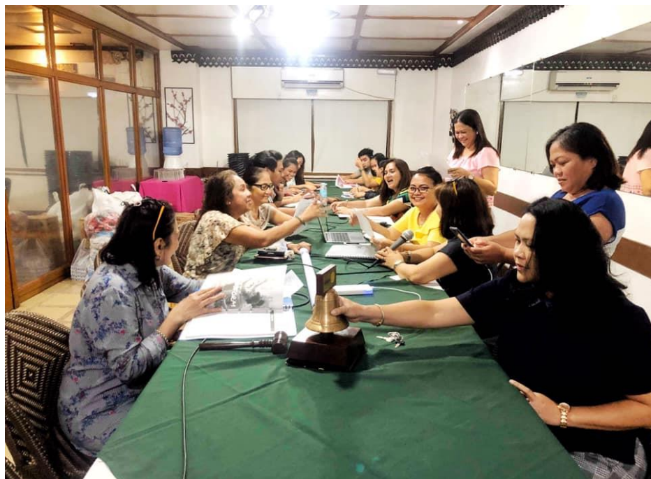
RCDB Regular Meeting at Balanghai Hotel Kapihan, Doongan, Butan City, July 19, 2019.