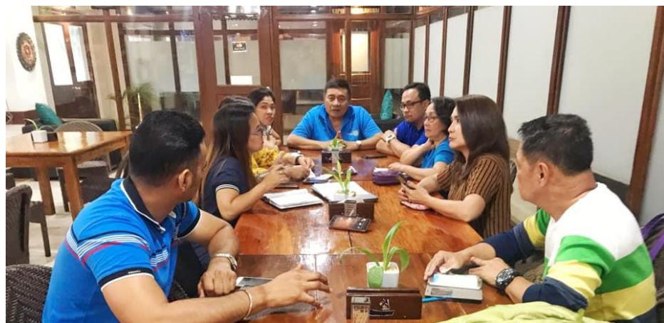
Area Coordination Meeting (ARCOM) with rotary clubs of Areas 3I and 3J at Balanghai Hotel Coffeeshop, Doongan, Buutan City, July 27, 2019.